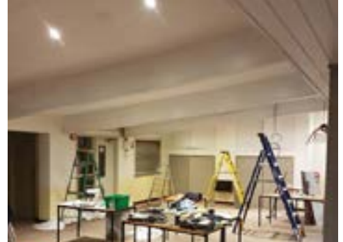
Exciting Clubroom Updates!