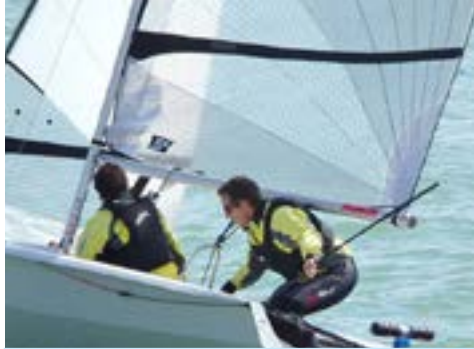
What it is like to sail during the Winter season