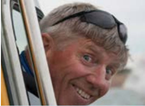
Welcome to the 2017 season from our new Commodore